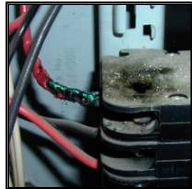
Stab-Lok breaker casing (blow out)

National Testing Labs have documented that Federal Pacific (FPE) Stab-Lok panels and breakers have a very high failure rate at service terminals, buss bars and breakers. Electricians will not work on Stab-Lok breaker panels and ASHI home inspector reports require replacement. Some insurance companies are requiring replacement of FPE Stab-Lok breaker panels as a requisite for insurance coverage.