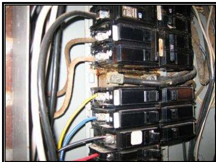
Sylvania- Service terminal and buss bar defects