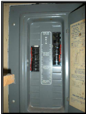
FPE Stab-Lok with cover in place.