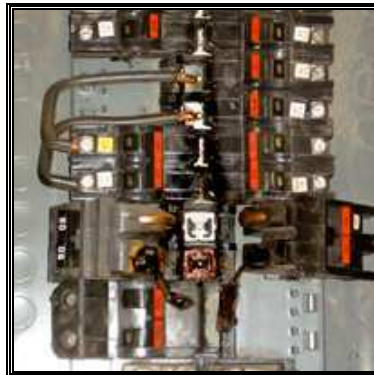
Stab-Lok with defective terminals and buss bars